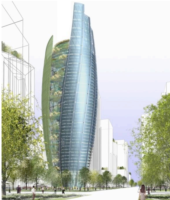
Conceptual Office of the Future for Fortune by William McDonough + Partners

Through video-based case studies, expert insights, and team exercises, EDG and facilitators will educate and challenge participants to transform their thinking and innovate for the future. This workshop was developed in collaboration with MBDC and William McDonough + Partners Architecture and Community Design.